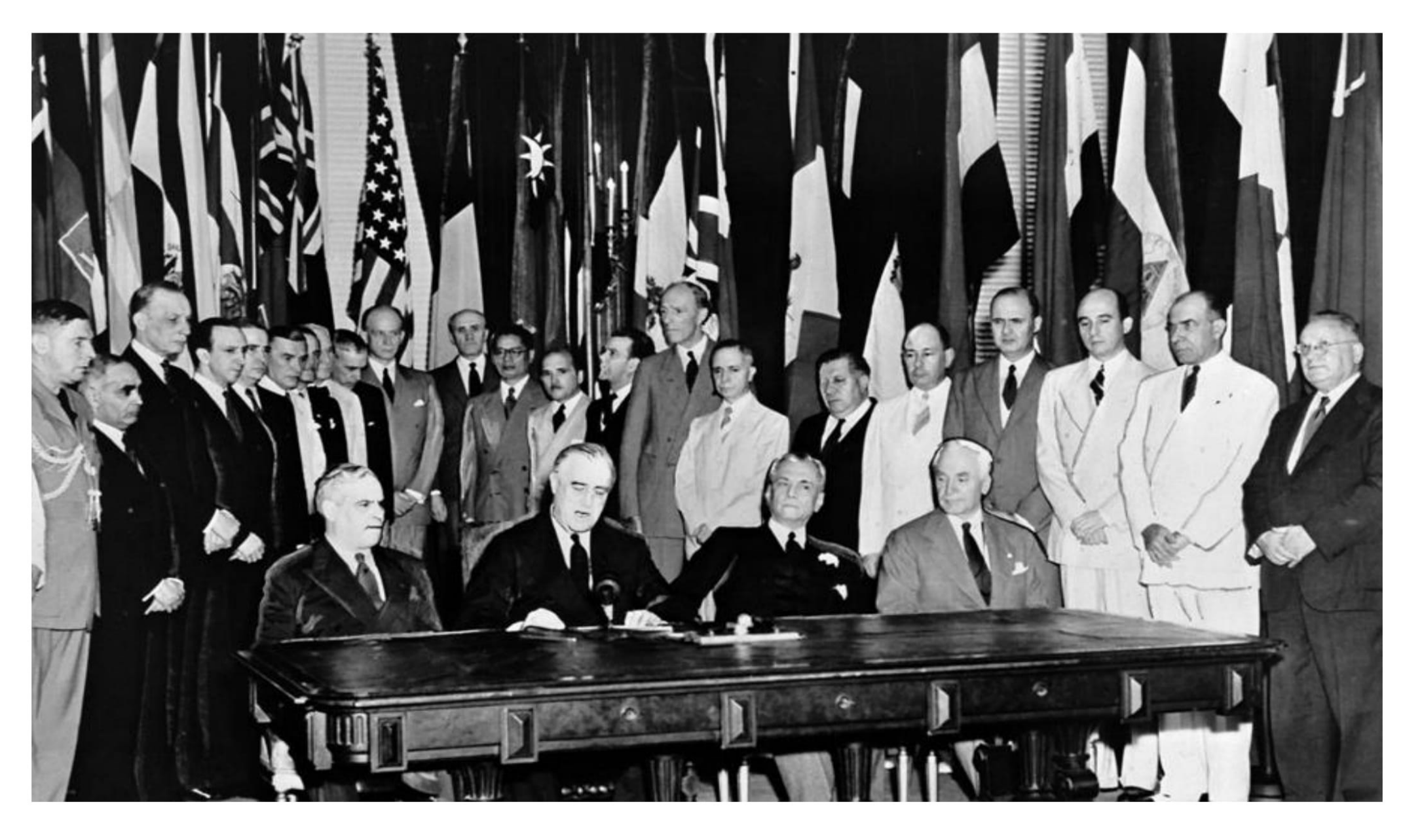
1 January 1942 || The name "United Nations" is coined

The name "United Nations", coined by United States President Franklin D. Roosevelt was first used in the Declaration by United Nations of 1 January 1942, during the Second World War, when representatives of 26 nations pledged their Governments to continue fighting together against the Axis Powers.