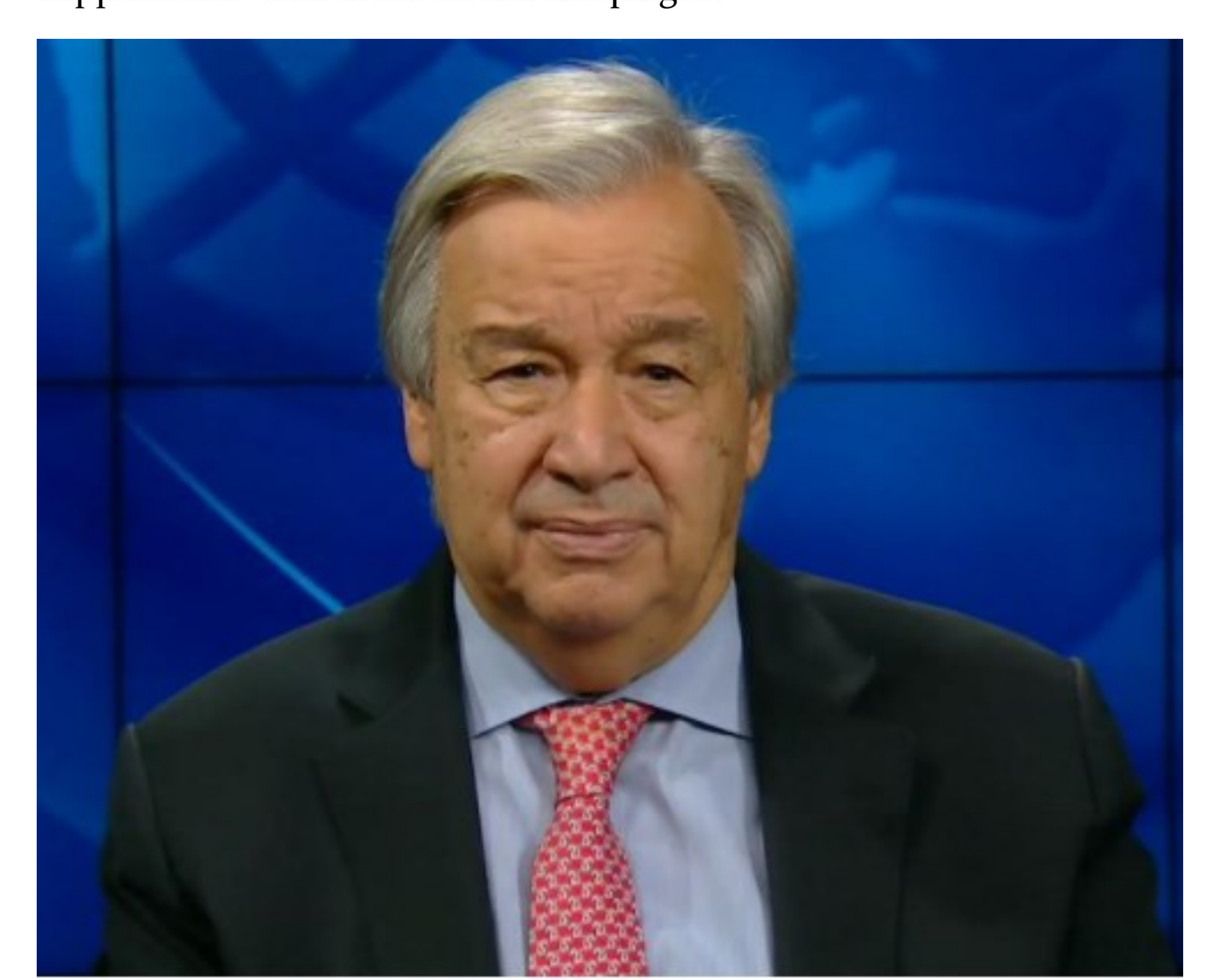
UN Secretary General—Antonio Guterres

Each year, the global network of UN Information Centres organizes a variety of events to mark UN Day. Activities range from ceremonies, seminars, panel discussions, symposiums to series of briefings for students, art competitions, rallies, film screenings and book/photo exhibitions, media campaigns- including interviews and newspaper supplements- and social media campaigns.