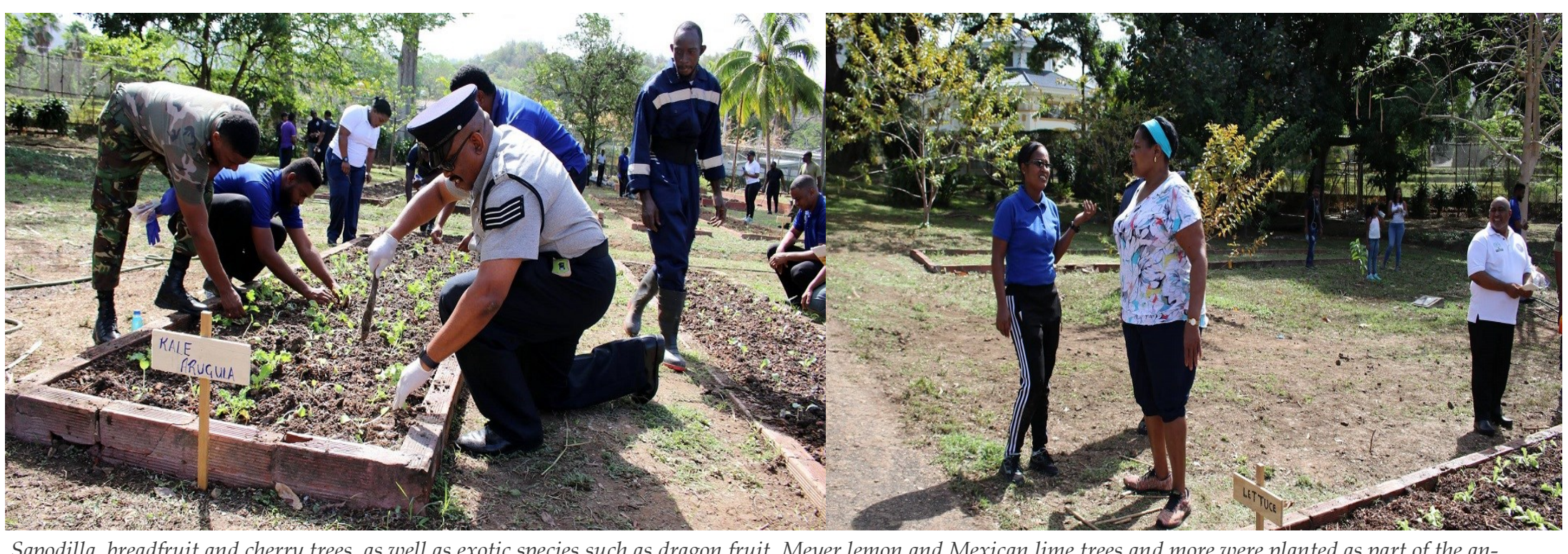
Sapodilla, breadfruit and cherry trees, as well as exotic species such as dragon fruit, Meyer lemon and Mexican lime trees and more were planted as part of the annual Corpus Christi observation at the President's House on Thursday 11th June 2020.

Since there is often a great deal of rainfall around the time of the Corpus Christi celebrations, gardeners in Trinidad and Tobago consider the day to be good for planting, as it is believed that anything planted on this day will thrive. The prospect of showers does not in any way deter those observing the day, whether planting or taking part in the public processions. Both farmers and first time planters try to get the best fruit and vegetable plants for this occasion and many gardeners stock up on seeds, seedlings, plants and fertilizers. Some planters also carry their seeds to church services for blessing. Among the popular plants purchased during this time are tomatoes, hot peppers, melongene (eggplant or aubergine), ochro, patchoi (Chinese cabbage or bok choy), lettuce, and grains such as corn and pigeon peas.